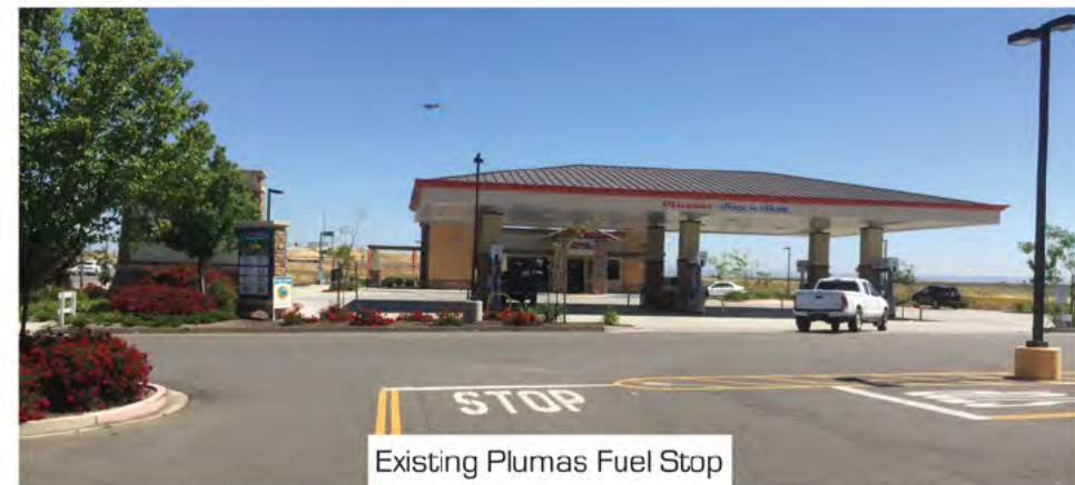
Existing Plumas Fuel Stop