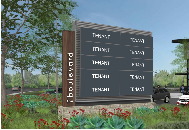
Three Monument Sign Locations Available

The Boulevard is a vibrant retail experience in the urban core of Sacramento. You'll find everything from restaurants, fine dining, to local boutiques and more.